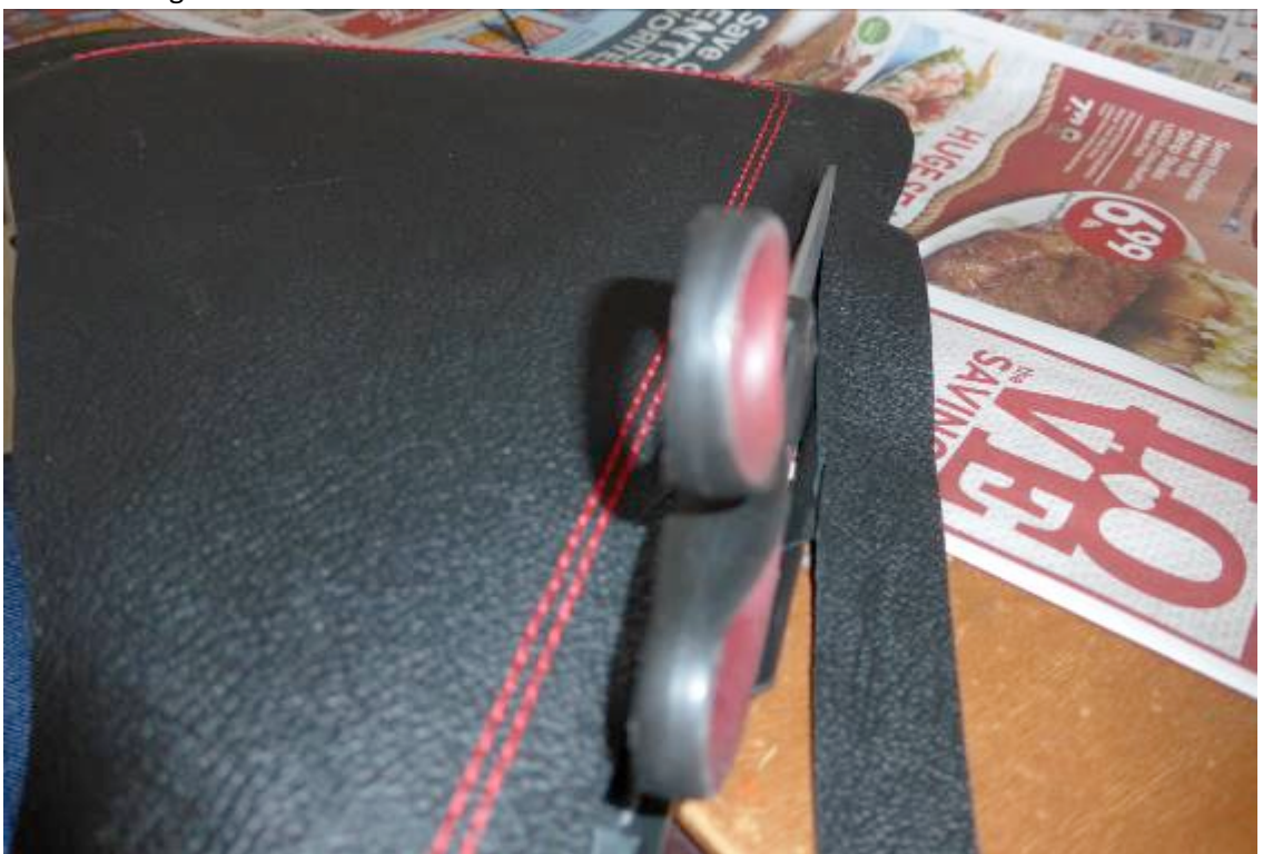
Work around the piece gluing the leather to the edges of the plastic

Trim the edges of the leather so it will wrap around the edge of the pad without interfering with any of the mounting tabs.