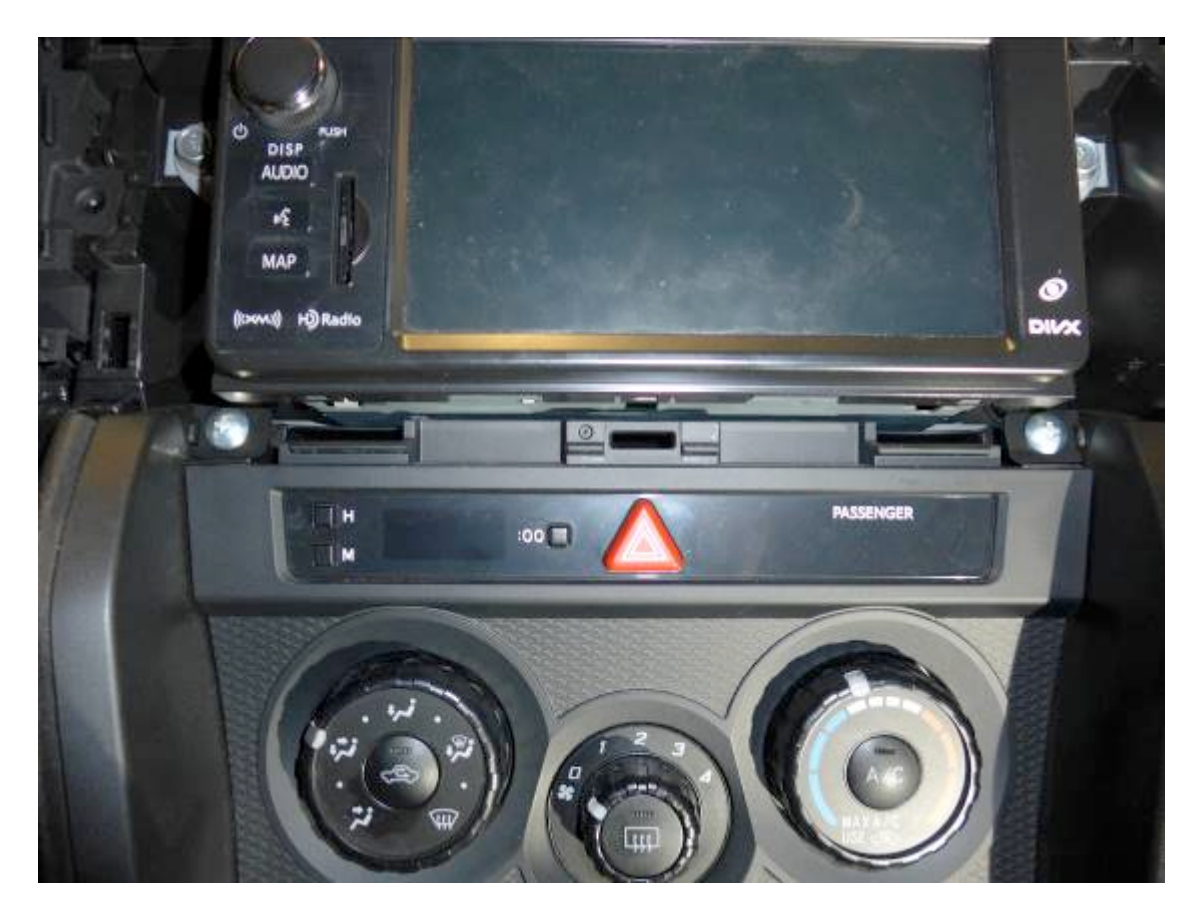
Remove this screw, then pull up to separate the inner and outer parts of the pad.