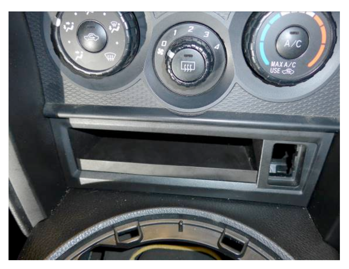
Remove the last two screws that hold the console in place, then remove the console from the vehicle. Remove the connector to accessory power as you do.