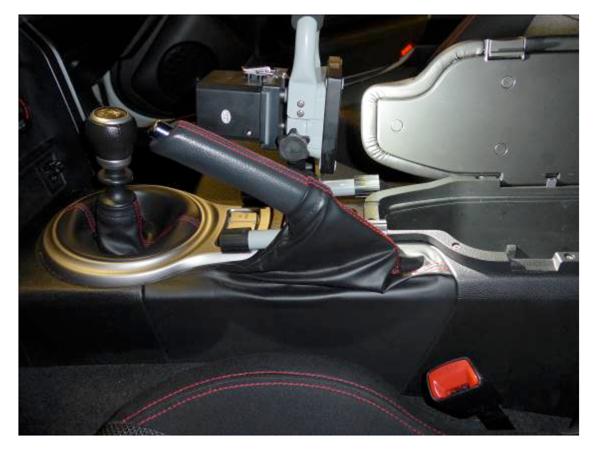
The shift boot comes off next. First, twist off the shift knob. Then, use a trim tool to separate the silver trim piece from the console.